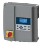
Smart box (with 2 pump versions)