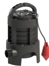
Sanipump VX S