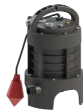
Sanipump GR S